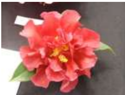
Best Bloom in Show unprotected: 'Pat Pinkerton' Chuck & Bev Ritter